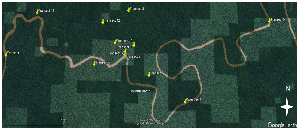
Figure 1. Location of the survey transects (marks show the coordinates of the beginning of each transect)

the canoe to continue the survey (de la Torre et al., 2009). When we found a group of pygmy marmosets, we approached the animals slowly and quietly, and observed them for about 1 – 2 hours to record the group size and composition. The minimum distance between the observers and the marmosets was 3 m.