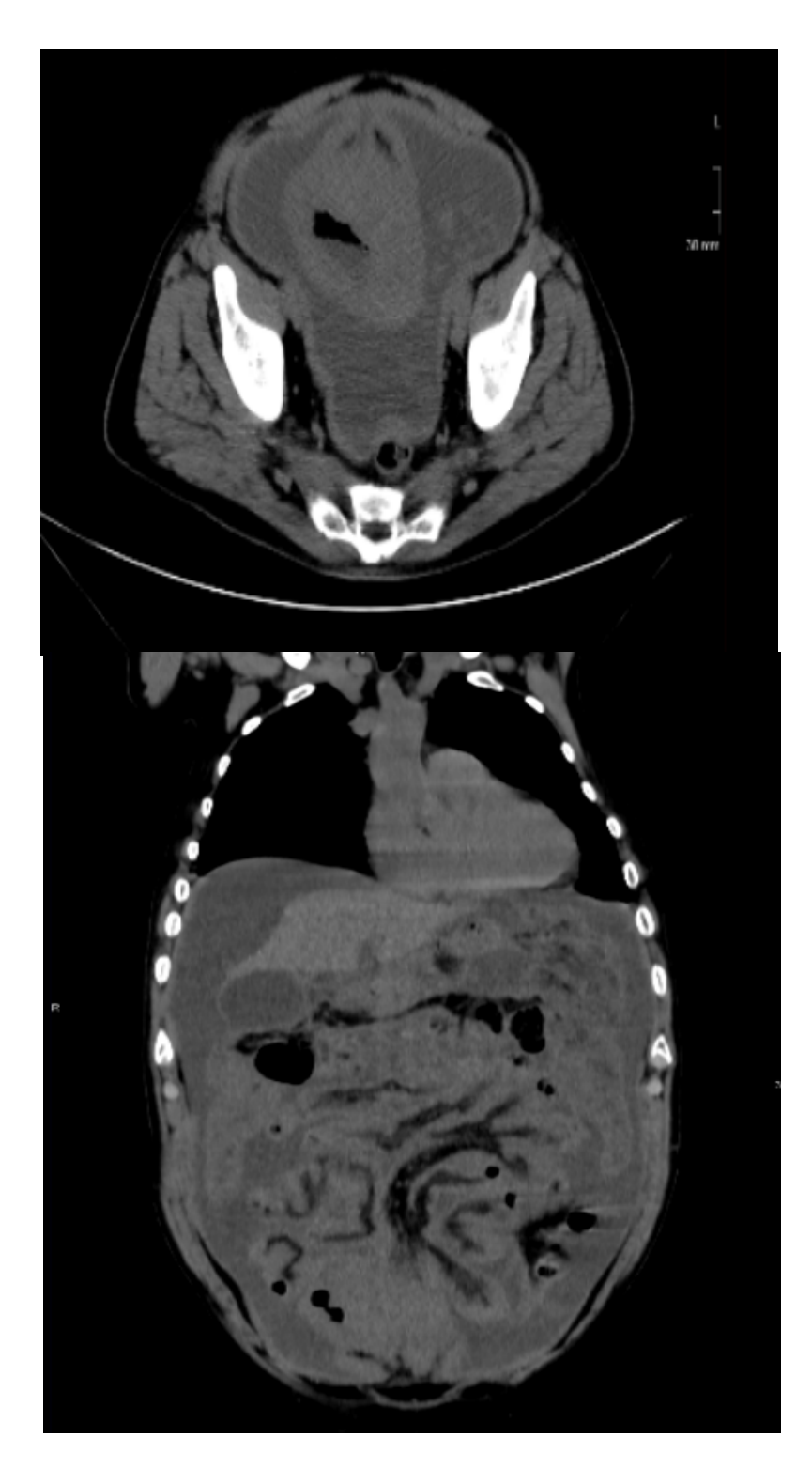
Figure 1. Abdominal computed tomography

The hospital in which the patient had been previously hospitalized was contacted to initiate chemotherapy; the tissue sample that was analyzed by histopathology had a cellularity consistent with non-Hodgkin Lymphoma nonetheless the sample was insufficient for