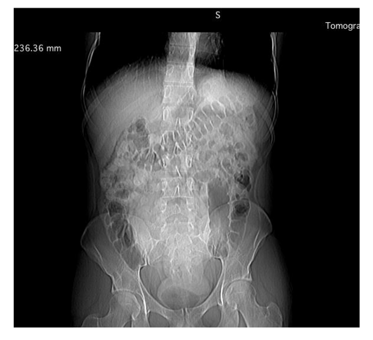
Figure 1. Abdominal CT scan

including: compression of intestinal loops, ingurgitation of mesogastric vessels and compression of the vesicle dome.