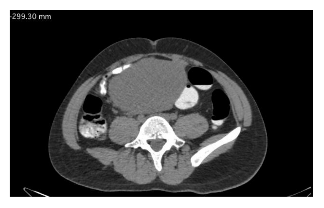
Figure 2. Abdominal CT scan